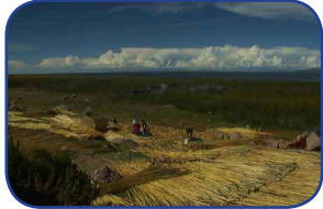
27/12/04 Day 267 Jilca Mile 27370