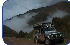
9/12/04 Day 249 Buena Vista Mile 25557