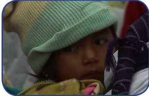
3/12/04 Day 243 Otavalo Mile 24210