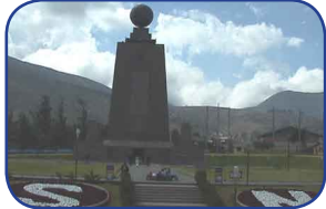
2/12/04 Day 242 Mitad del Mundo Mile 24102