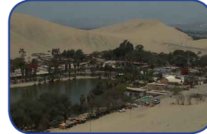
11/12/04 Day 251 Huacachina Mile 26020