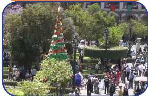
24/12/04 Day 264 Arequipa Mile 27130