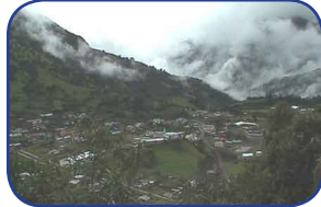
6/12/04 Day 246 Alousi Mile 24670