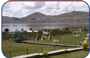
26/12/04 Day 266 Puno Mile 27330