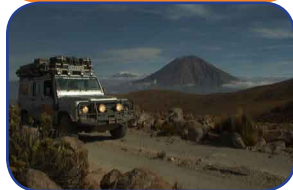
22/12/04 Day 262 Chachani Mile 27095