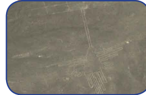
12/12/04 Day 252 Nazca Mile 26208