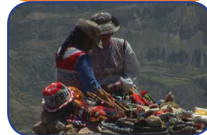
21/12/04 Day 261 Canon de Colca Mile 27005