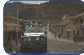
15/12/04 Day 255 Ollantaytambo Mile 26607