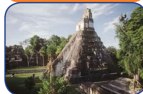
Mayan cities in Guatemala...