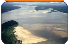
The mighty Amazon...