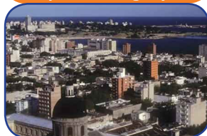
Montevideo, the capital of Uruguay...