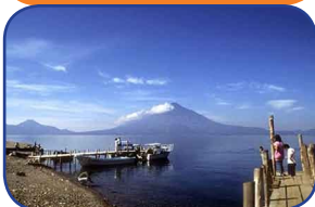
Lake Atitlan volcanoes...